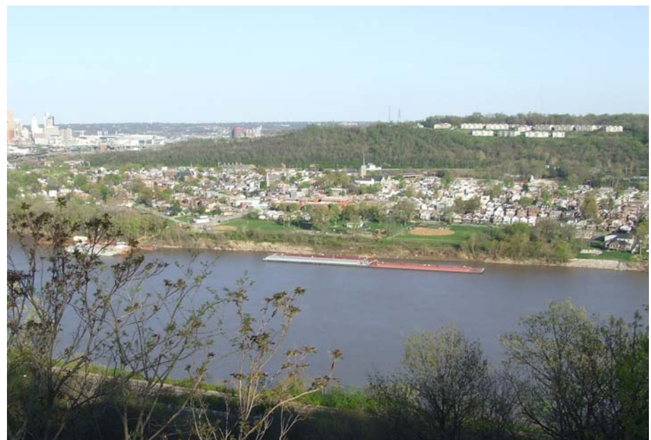
Ludlow, KY hillside pre-cutting April, 2012