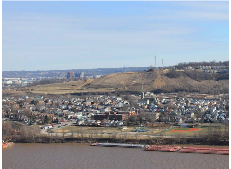
Ludlow, KY hillside post-cutting - January, 2024

Opponents, including The Hillside Trust and adjacent neighbors, urged the City to take a step back and really examine the infrastructural and environmental impacts this development will inflict upon the community. In particular, The Hillside Trust recommended that Ludlow hire an independent engineering consultant to evaluate the geotechnical impacts of a massive development of this scale, and not simply rely on the word of Fischer's professionals that everything would be okay. This did not happen.