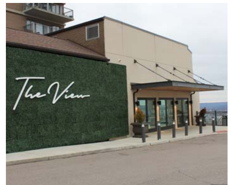
The View at Mt. Adams