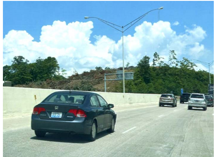
Silverton hillside in process of being flattened

There are no formal plans as yet for the property. Silverton lacks meaningful hillside regulations, thereby allowing the developer to obliterate this once-beautiful green space. Word has it that it will be marketed for sale as an office park. Since COVID, this region has experienced a glut of office space with more businesses allowing their employees to work from home. The Hillside Trust sought the