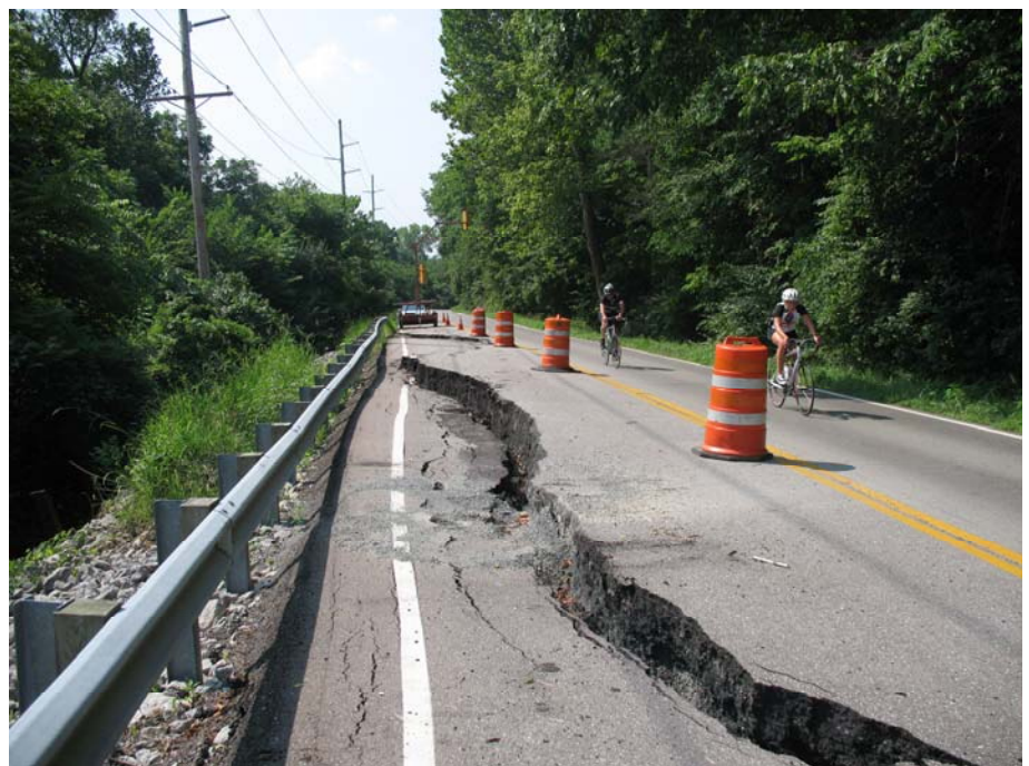
Landslide on Rt. 8 in Northern Kentucky

Check program listings on day of broadcast in case of any changes.