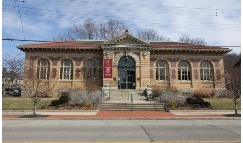
Carnegie Center - 3738 Eastern Ave Columbia Tusculum