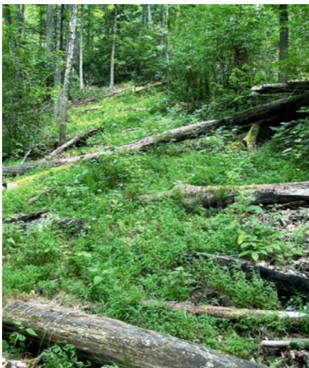
One area of fallen trees

Approximately one mile of trail is now open. The upper section of trail includes a short story walk, with poster boards of pictures and text for kids to enjoy. The trailhead is located at the end of Brokaw Ave, a small street that stubs off of McHenry Ave.