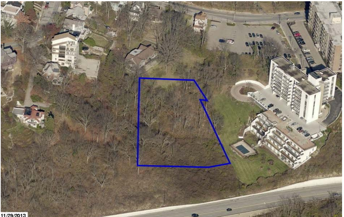
Aerial map of 1-acre Segoe Preserve in East Walnut Hills, Cincinnati

The Hillside Trust 710 Tusculum Ave, Alms Park Cincinnati, OH 45226